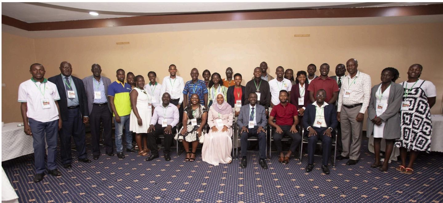
Participants for the parallel session on strategies to boost employability