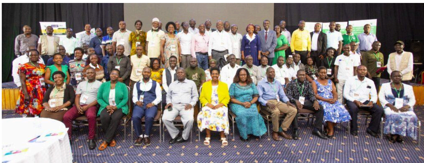
Participants of the policy dialogue on private-sector-led extension and advisory services