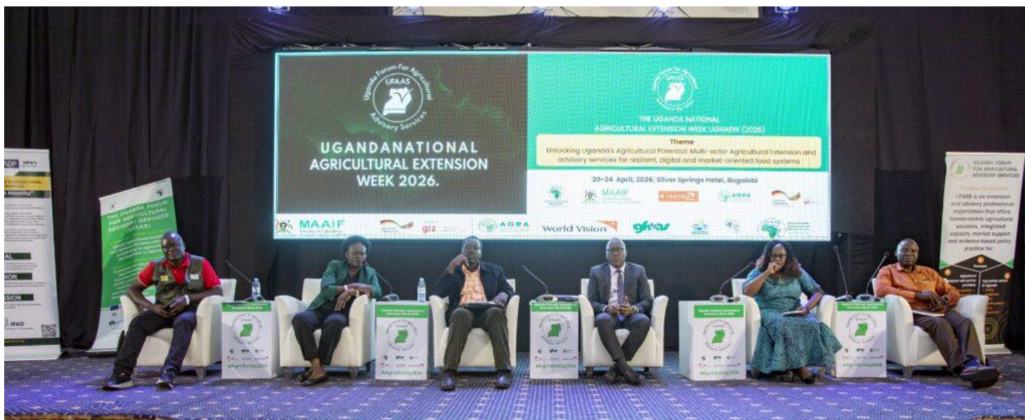
Panelists for the session on professionalization of the agricultural workforce