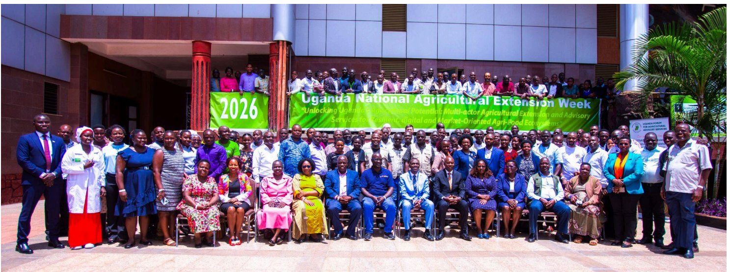
Group photo of participants at the extension week