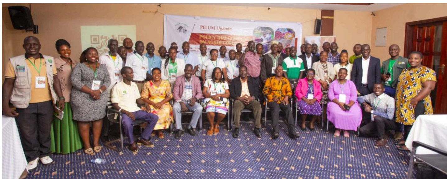
Participants of the session on integrating agroecology in extension