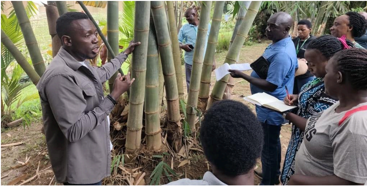
Participants during a field visit at a Bamboo farm