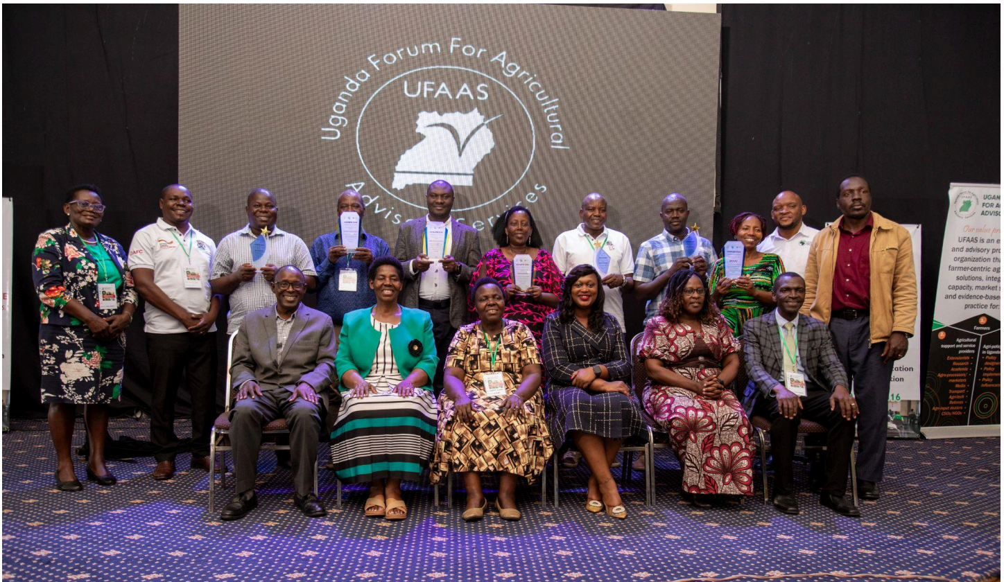
Awardees (holding plaques) with some of the event officials.