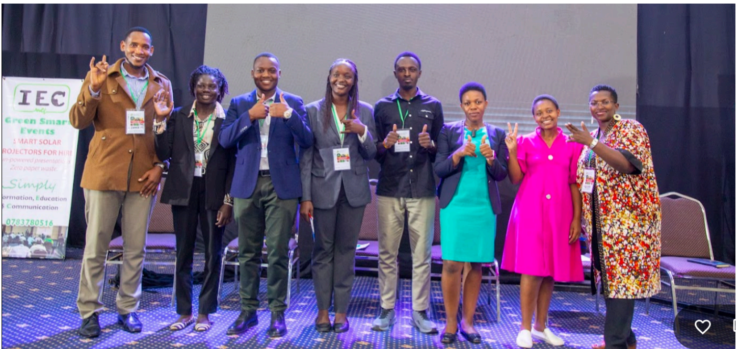
Youth representatives after a panel discussion