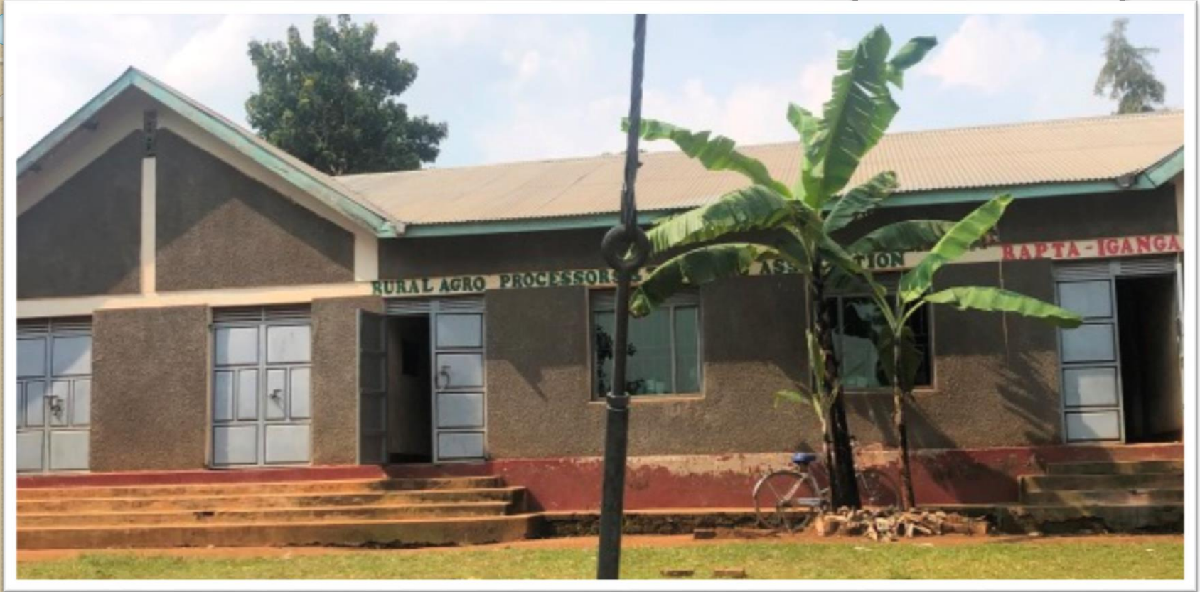
Experiences of Peri-Urban Farming