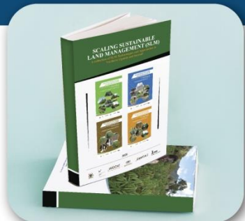
SLM CATALOG NOW AVAILABLE IN HARD COPY